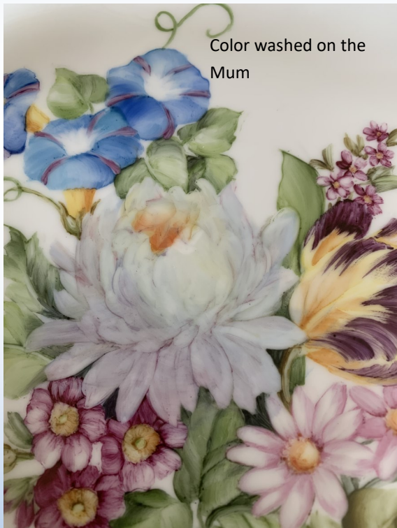
Color washed on the Mum