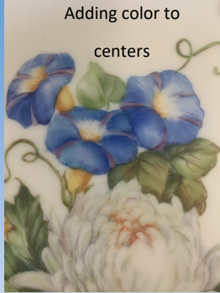
Adding color to centers